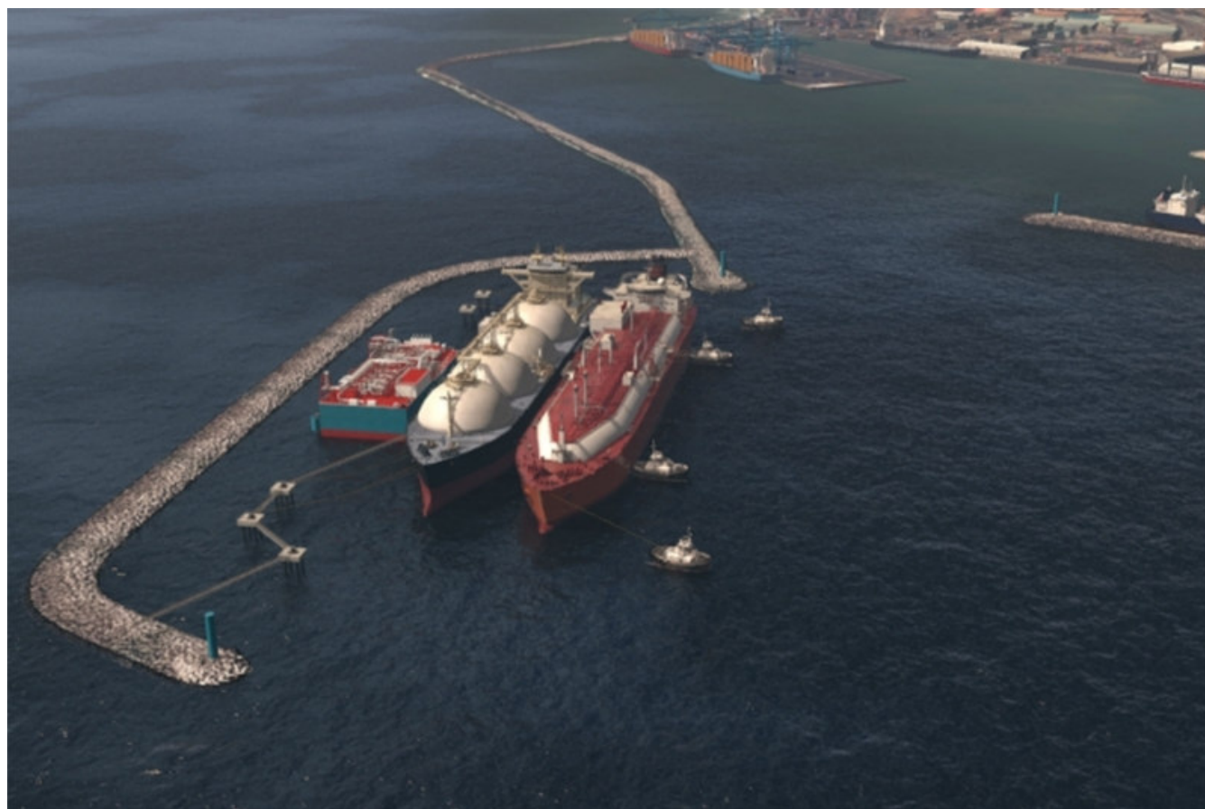
Tema LNG gas import project.

The Spanish operator Reganosa has already picked out a dream team to operate and maintain Ghana's Tema LNG terminal days after winning the contract. [...] (290 words)